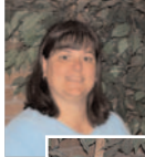
Connie Zinn ▶ Minister of Preschool & Children